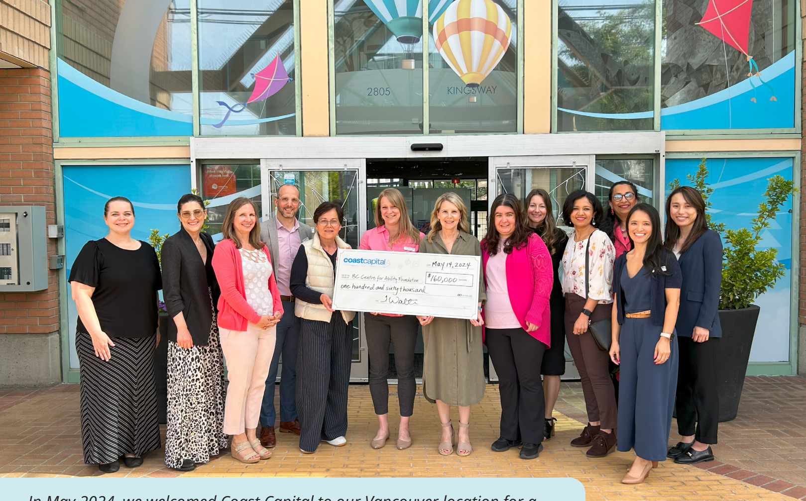
In May 2024, we welcomed Coast Capital to our Vancouver location for a cheque presentation for their funding of our Coast Capital THRIVE Program!