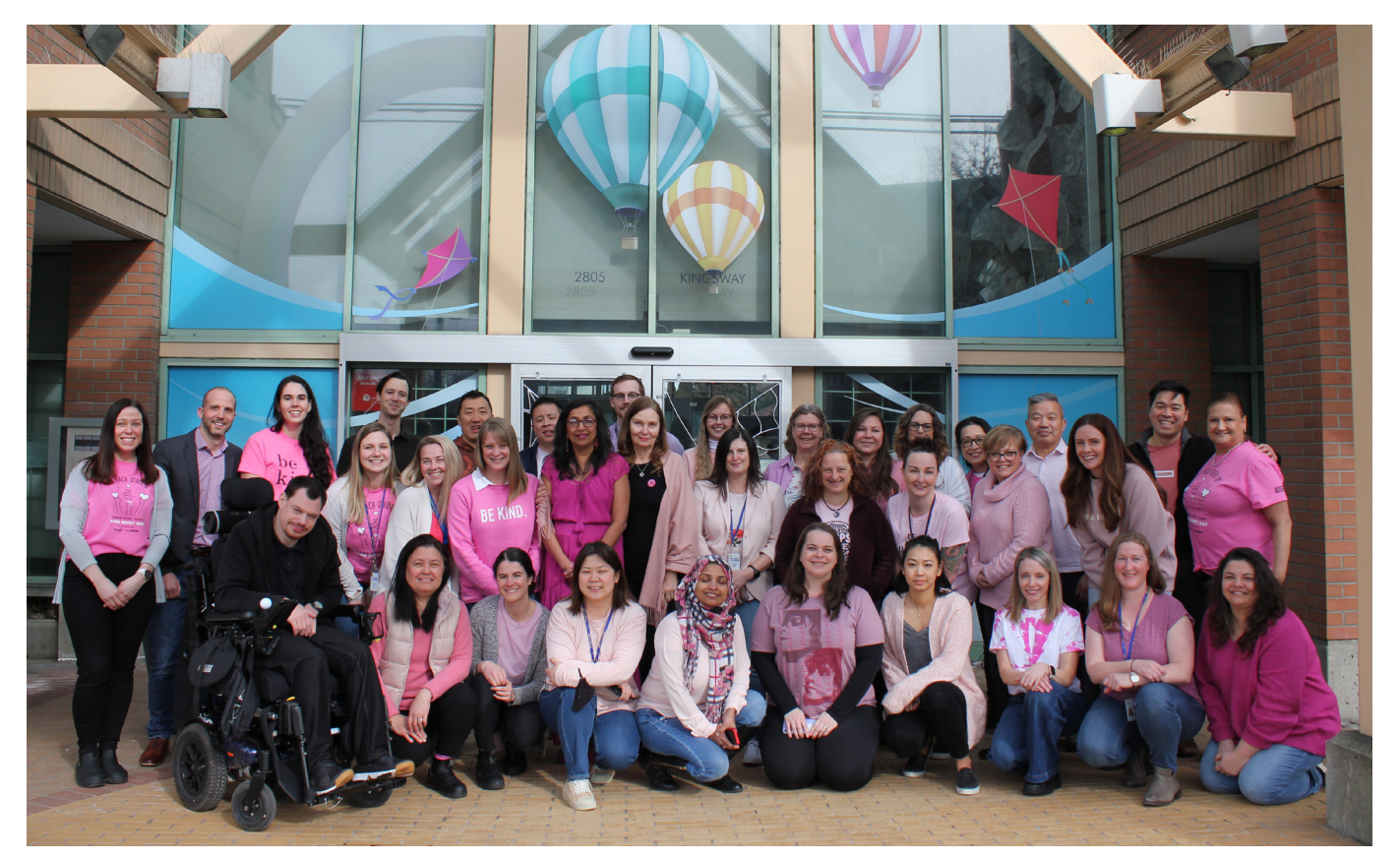
BCCFA staff on Pink Shirt Day, February 2023.

Family Centred: We honour and respect the unique needs and preferences of our clients, celebrate our diversity and ensure that clients, families and caregivers are at the centre of everything we do.